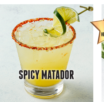
Herradura Reposado Tequila Pineapple, Lime, Serrano Chilies 13