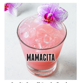
Ron Rio Rum, El Jimador Tequila, Jamaica Syrup, Cointreau, Orgeat, Lime 14