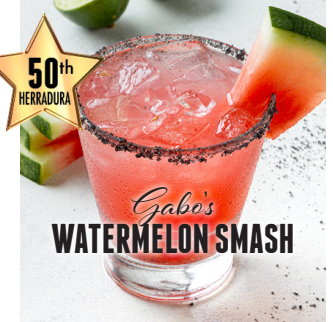
50th Anniversary Herradura Tequila, Watermelon, Agave, Lime, Triple Sec 14