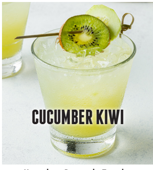
Herradura Reposado Tequila, Kiwi, Cucumber, Lime 14