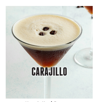
Mario's Hard Espresso, Licor 43, Coffee 14