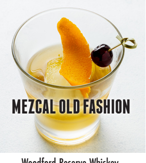
Woodford Reserve Whiskey, Xicaru Mezcal, Bitters 14